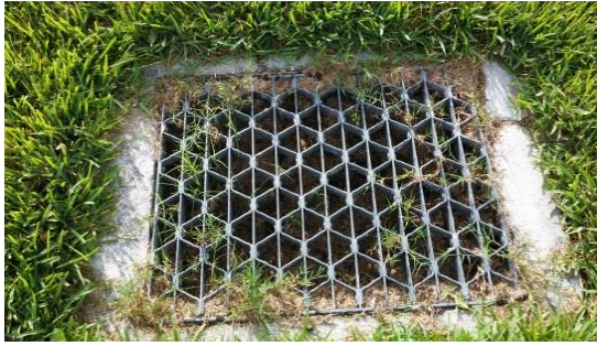
Riverwood Drive, RCDD Pond #37 38 (RD38) Box Inlet

12. Irrigation System: No issues were observed this month.