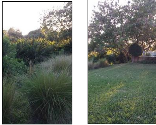
Photos: Tract F & G (Between Bay Ridge and Riverside Neighborhoods)

Left: Actual view of the canal after clearing exotic