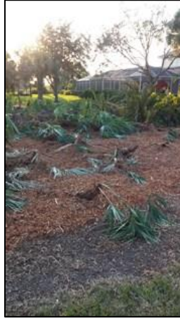
Preserve J (Small Area on the Northeast side) after clearing exotics